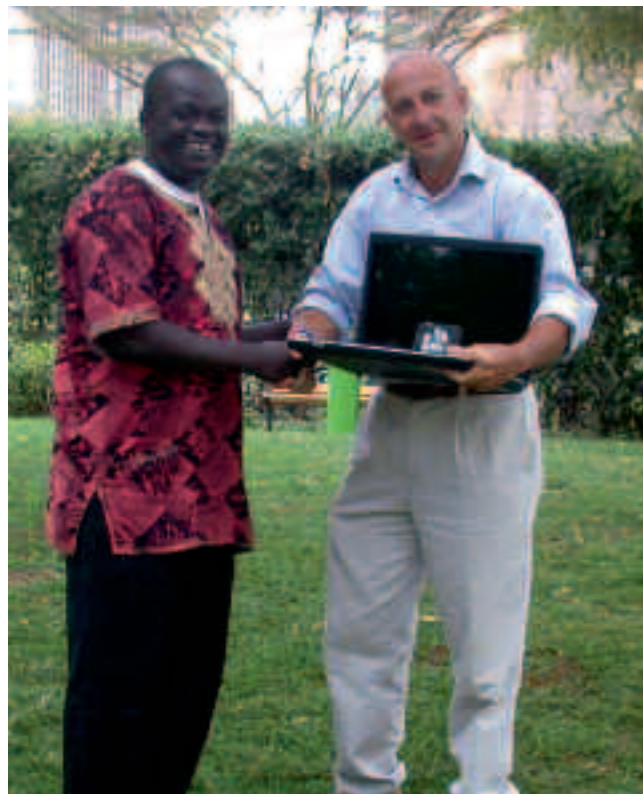
the handover at the Serena Hotel Nairobi.