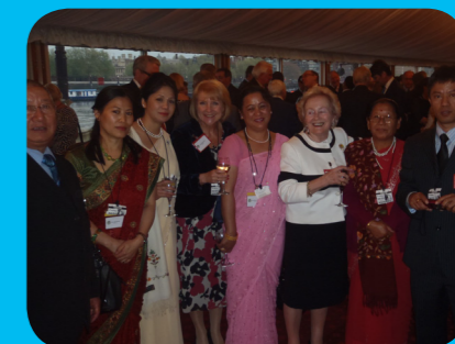
Some of those attending